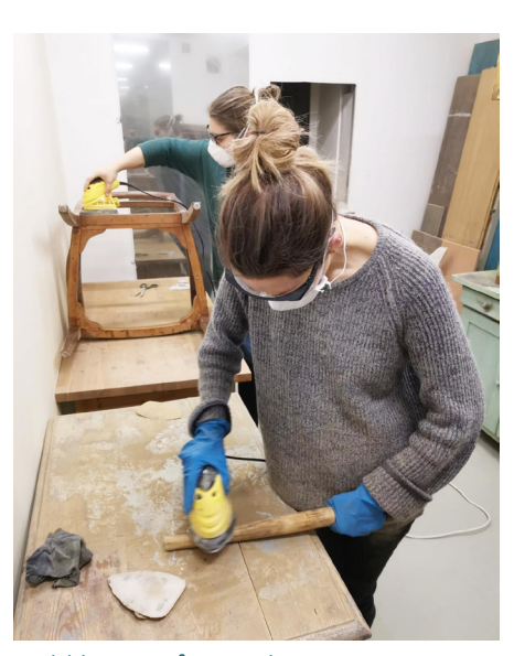
Activities part of renovation recourse.

A CBM uses circularity as the main mechanism for value creation – not a complementary activity. In order to embed circularity at the core of value creation, enterprises must (re)design the products and services they supply, the relationships they have with suppliers and consumers as well as their internal operations. Only then, circularity can be placed at the core of value creation of the firm instead of a cost-efficiency measure or a waste handling practice.