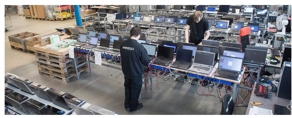
Testing/data wiping line at Inrego.

At CircularPP we analyzed 50 cases of CBM of SMEs operating in seven different countries: Denmark, Sweden, Finland, Poland, Latvia, Russia and the Netherlands. Based on this analysis, it was possible to determine how are SMEs creating value through circularity in specific product groups.