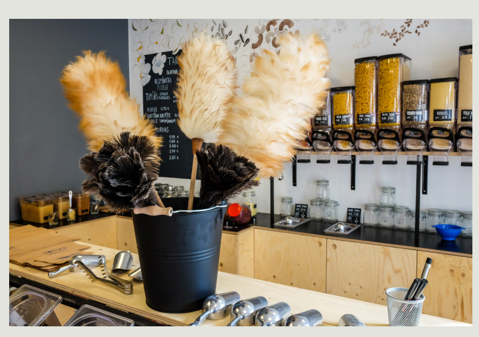
Inside of zero-waste shop Turza.